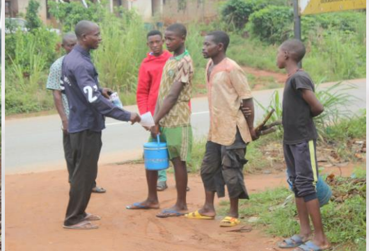
Volunteers out in the field during the morning prayer outreach