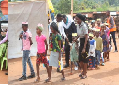
Children marching out for their presentation