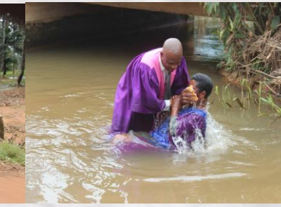
Baptism of a converted soul in progress