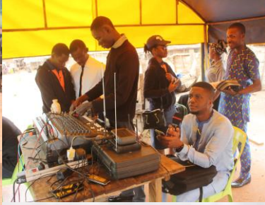
The electrical and technical life unit of the mission