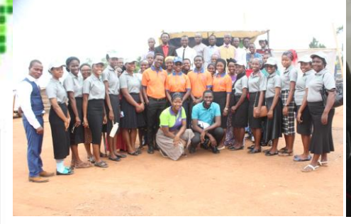
Mission volunteers in a group photograph