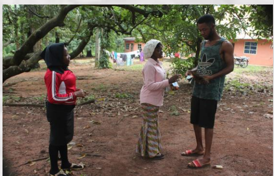
Volunteer giving out a flier during the morning prayer outreach