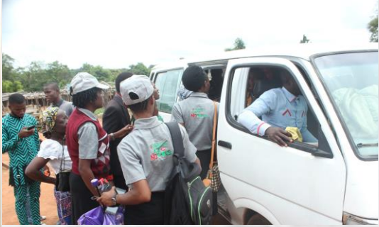
Bus used during mission to convey mission equipments and run some errands