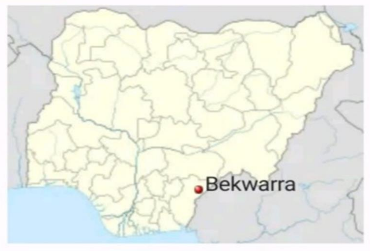
Bekwarra Local Government Area on the Map of Nigeria