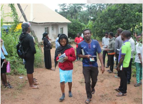
Volunteers launching out for morning prayer outreach