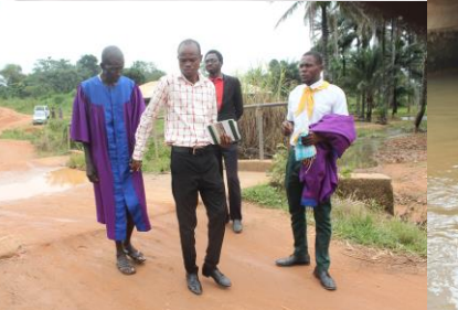
A volunteer leading a blind friend to the river to be baptized