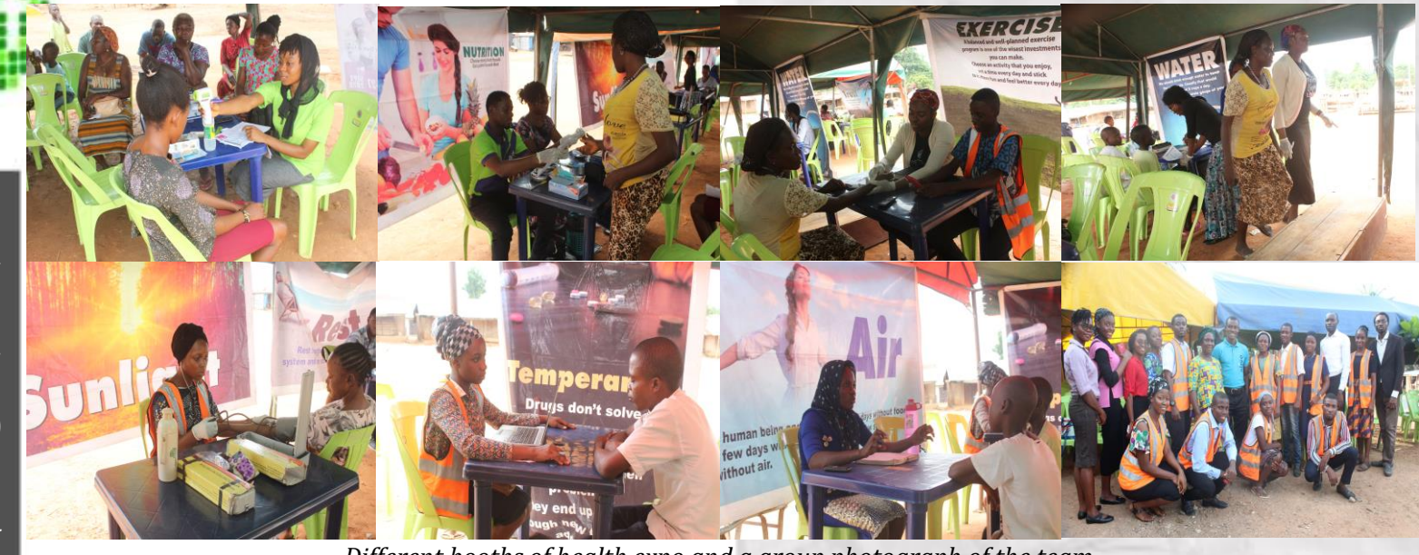
Different booths of health expo and a group photograph of the team