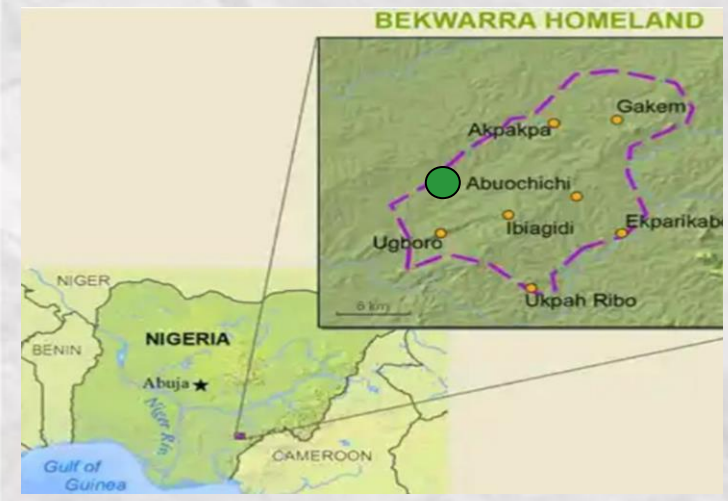
Bekwarra Local Government Area showing Abuochiche on the Map of Nigeria